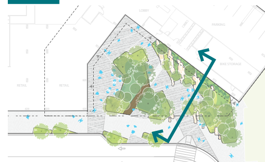
PARK SECTION 1